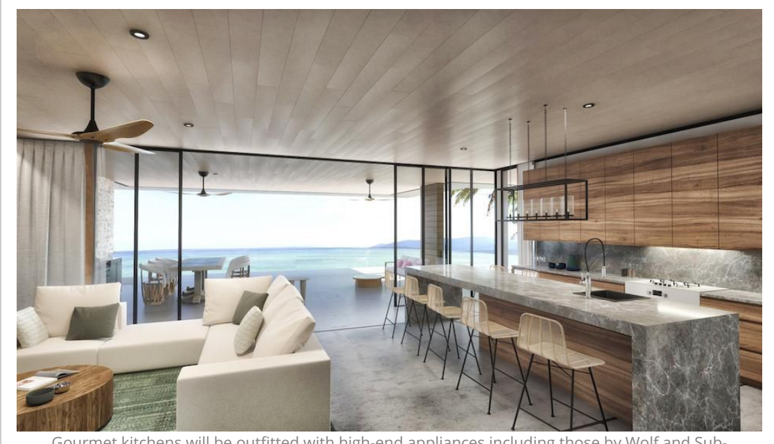
Gourmet kitchens will be outfitted with high-end appliances including those by Wolf and Sub-Zero.

SV Capital Partners, a boutique real estate investment and development firm with a focus on luxury resort properties, is developing homes ranging from three-bedroom three and a half bathroom Beach Casitas with 4,101 square feet of interior living space and 4,729 square feet of exterior living space to a six-bedroom Presidential Villa with more than 19,000 total interior and exterior square feet of living space. Beach Casitas will include a game room, a private terrace, with pool, jacuzzi and fireplace, outdoor bar with a grill and a pizza oven.