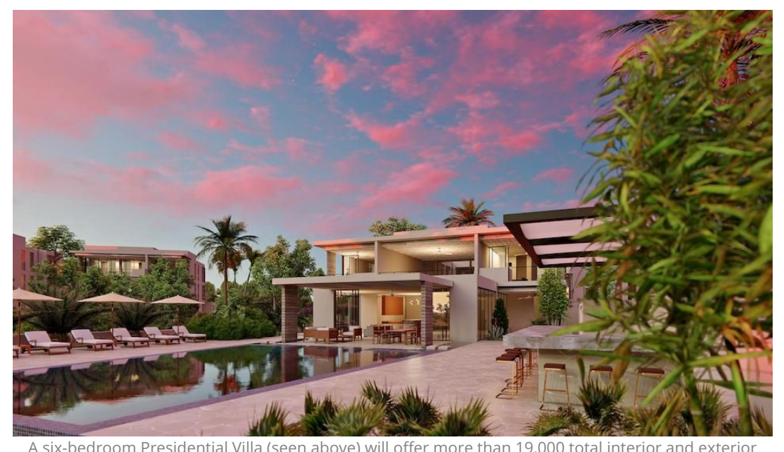
A six-bedroom Presidential Villa (seen above) will offer more than 19,000 total interior and exterior square feet of living space

<u>A select number of the homes are now available for purchase as part of a</u> <u>Founder's Program</u>. A $50,000 non-refundable deposit is required to reserve a residence.