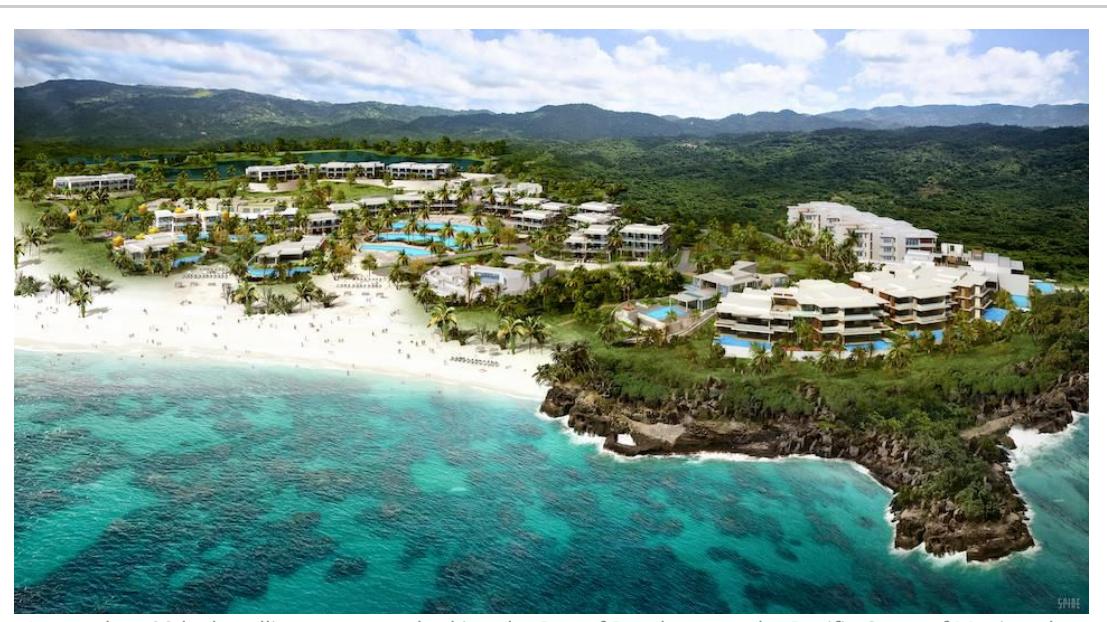
Located on 33 lush, rolling acres overlooking the Bay of Banderas on the Pacific Coast of Mexico, the luxury boutique resort will feature 59 hotel guest suites and 30 contemporary beachfront residences surrounded by tropical jungle and pristine white sand beaches.

<u>Auberge Resorts Collection</u> will open <u>Susurros del Corazón</u>, a luxury resort in late 2020. Located in Punta de Mita, Mexico, the resort will include a boutique hotel and beachfront residences priced from $1,950,000 to $10,900,000.