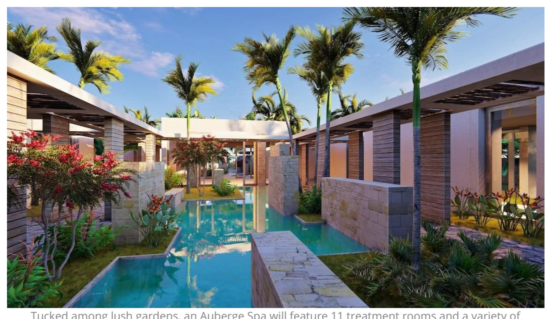
Tucked among lush gardens, an Auberge Spa will feature 11 treatment rooms and a variety of treatments inspired by the rich heritage and healing properties of the surrounding Riviera Nayarit region.

The resort is centered around three scallop-shaped pools that will cascade down to the beach, where clear blue waters invite surfing, snorkeling and fishing against the backdrop of the volcanic Marietas Islands, a protected wildlife refuge.