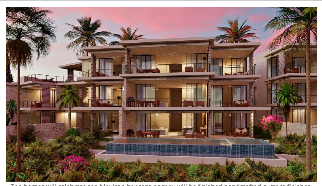
The homes will celebrate the Mexican heritage as they will be finished handcrafted custom finishes, artisanal wall coverings, and local artwork. They will feature open, airy living spaces that extend from the indoors out, highlighting the natural, untouched surroundings.

The homes will celebrate the Mexican heritage as they will be finished handcrafted custom finishes, artisanal wall coverings, and local artwork. They will feature open, airy living spaces that extend from the indoors out, highlighting the natural, untouched surroundings.