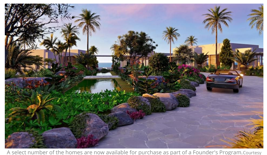
A select number of the homes are now available for purchase as part of a Founder's Program.

Tucked among lush gardens, an Auberge Spa will feature 11 treatment rooms and a variety of treatments inspired by the rich heritage and healing properties of the surrounding Riviera Nayarit region.