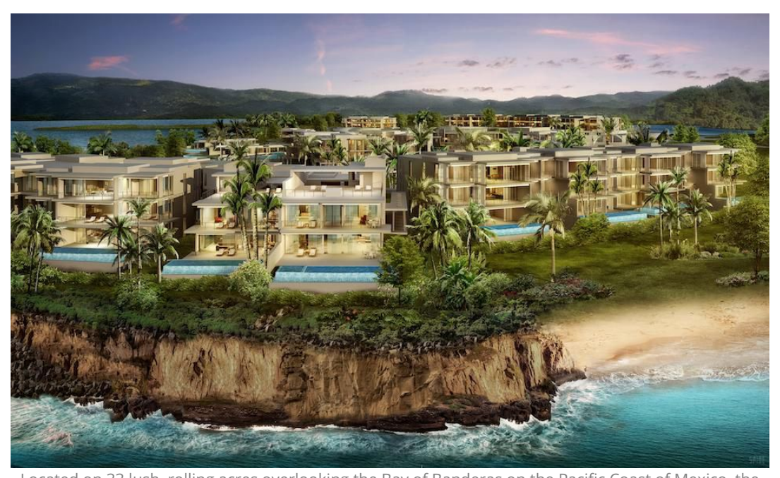
Located on 33 lush, rolling acres overlooking the Bay of Banderas on the Pacific Coast of Mexico, the luxury boutique resort will feature 59 hotel guest suites and 30 contemporary beachfront residences surrounded by tropical jungle and pristine white sand beaches.