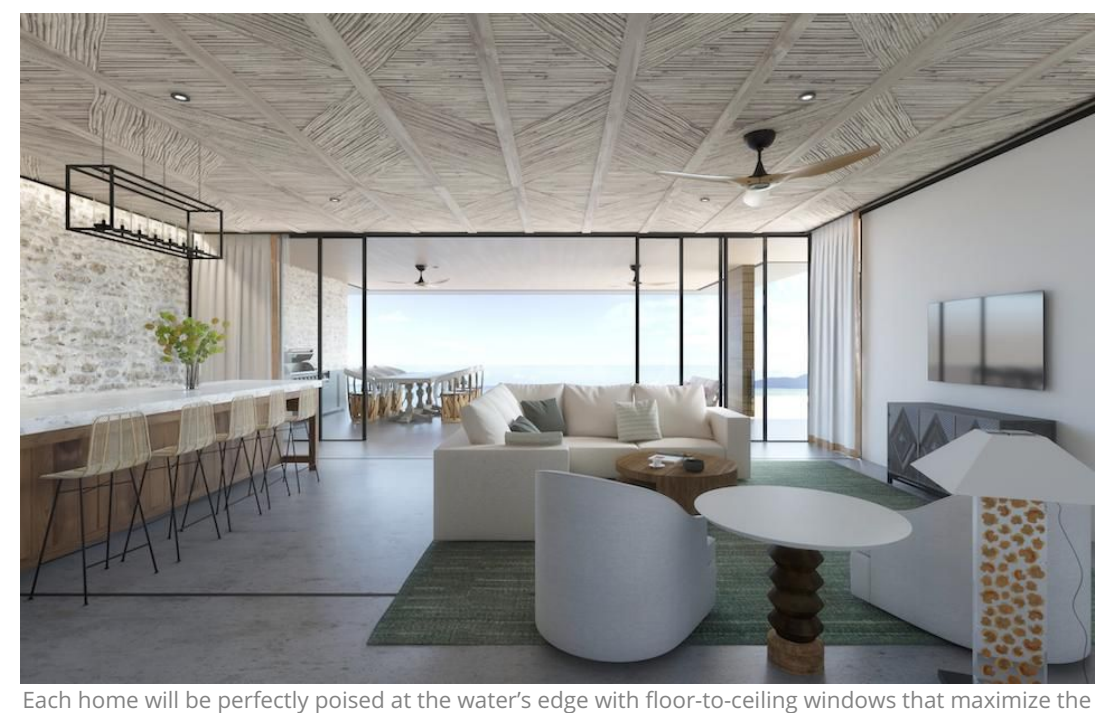
stunning views.

The homes will celebrate the Mexican heritage as they will be finished handcrafted custom finishes, artisanal wall coverings, and local artwork. They will feature open, airy living spaces that extend from the indoors out, highlighting the natural, untouched surroundings.