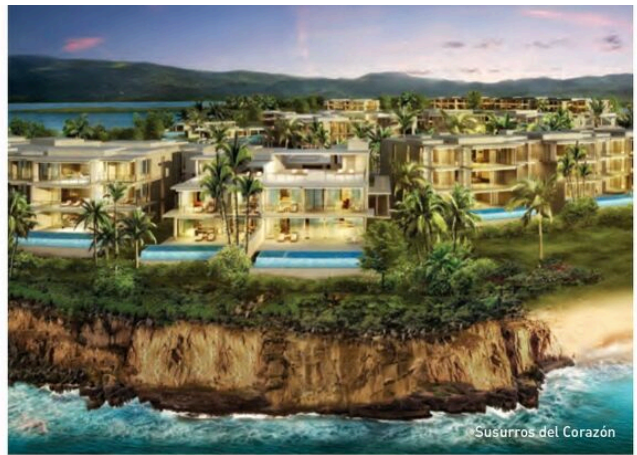
Susurros del Corazón

LA CLARA , a 25-story residential building by real estate developer Great Gulf, has broken ground in Palm Beach, Florida. Stantec is the architect of record, working in partnership with design architect Hariri Pontarini Architects. LA CLARA includes 83 residences ranging from 1,500 to