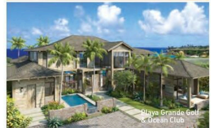
Playa Grande Golf & Ocean Club

FOR ADDITIONAL PHOTOS AND OPENINGS, VISIT oceanhomemag.com and our digital edition