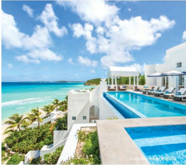
Long Bay Villas Anguilla